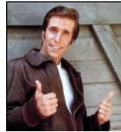
Henry "the Fonz" Winkler is PPB's January Honoree -