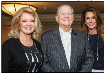
Honoree MARY HART, her husband, producer BURT SUGARMAN and supermodel CINDY CRAWFORD relax in the greenroom before the luncheon.

Mary and producer BURT SUGARMAN were married in 1989 and they have a son A.J. Mary gave an example of how she and her husband are forever joined together. "We were flying with President Ronald Reagan and I asked him to sign his autobiography to 'Mary and Burt.' Later we saw he signed it 'Maryanne Burt.' That's a gem, and that's so right about us, it's always Maryanne Burt."