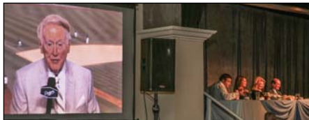
A surprise video was played at the luncheon with a greeting to MARY HART from VIN SCULLY. Mary and husband BURT SUGARMAN are big Dodgers supporters.