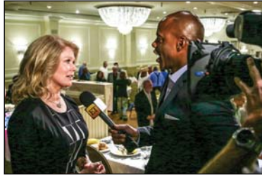
Current Entertainment Tonight co-host KEVIN FRAZIER interviews MARY HART at the PPB luncheon on September 30. The segment aired later that evening.

"MARY HART makes you happy. Sure she has grace and eloquence, but also, I just see Mary Hart and I'm happy," gushed KEVIN FRAZIER, current co-host of Entertainment Tonight about the beautiful trail-blazing former host of ET . At Pacific Pioneer Broadcasters' luncheon on September 30th, Mary Hart was honored and Frazier concluded that "Mary makes everyone happy because she's a Unicorn. If there's a rainbow, there's Mary." After hearing wonderful stories about Hart from her friends and colleagues, the PPB crowd at the Sportsmen's Lodge embraced Frazier's "Unicorn Theory."